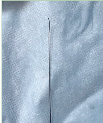
GLIDEWIRE ADVANTAGE TRACK™ post-procedure