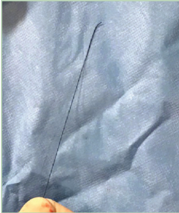
GLIDEWIRE ADVANTAGE TRACK™ pre-procedure

Typically, many doctors use the Boston Scientific V-18™ ControlWire™ Guidewire but the 0.018" GLIDEWIRE ADVANTAGE TRACK™ wire offers so much more. GLIDEWIRE ADVANTAGE TRACK™ wires give you the power and pushability needed to navigate and cross complex, multi-focal CTOs, maintain access, and deliver interventional devices, whereas V-18™ gets trashed in those types of procedures.